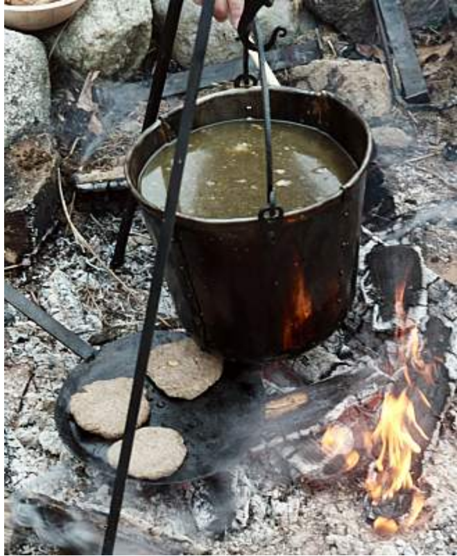
bread cooking on a flat pan under the stew pot at a recent Hurstwic feast

When done, the bread is light brown and sounds hollow when tapped, about 2-3 minutes on each side. Eat the bread warm.